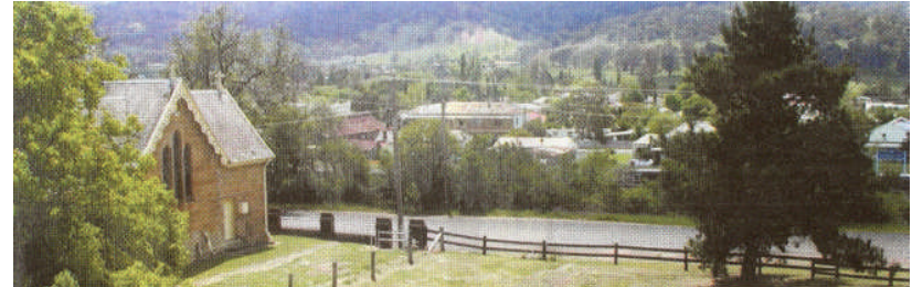
> Travel south on the New England Highway, past Emirates Park Stud to

Murrurundi Okm Historic railway town. The end of the rail line until the tunnel through the Great Dividing Range was opened in 1887, taking rail access to all the towns and the vast grain and wool growing areas of the Liverpool Plains and the north west slopes and plains of New South Wales, as well as rail access to Brisbane. Murrurundi VIC has information about local history.